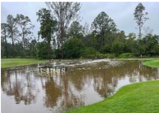
SOME FLOODING ON THE 14TH.