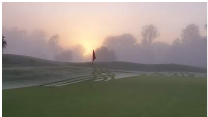
EARLY MORNING SUNRISE OVER THE 8TH GREEN.