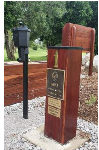
NEW BALL WASHER ON THE 16TH.