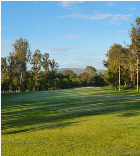
MORNING PHOTO OF THE 16TH.