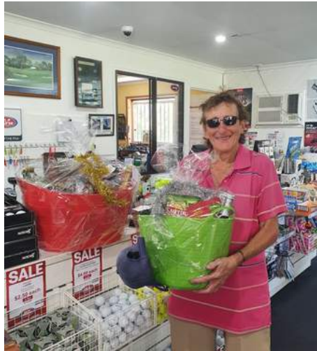
DI PICKING UP THE CHRISTMAS RAFFLE GOODIES.