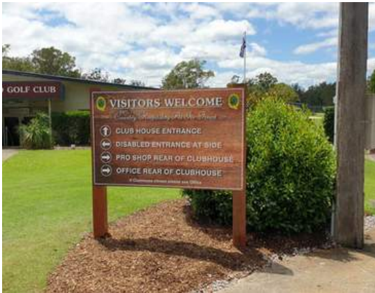
NEW SIGN PUT IN AT THE ENTRANCE.