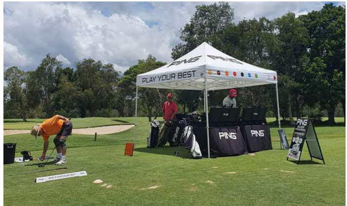
PING FITTING DAY SET UP.